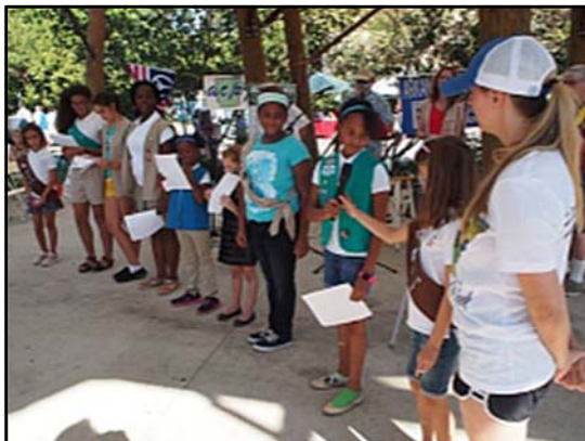
UUCLR Girl Scouts at Peace Fest