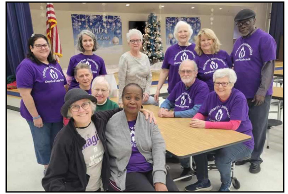
Food Pantry Volunteers

Generous donations continued to roll into UUCLR throughout January in support of the food pantry that we sponsor at Stephens Elementary School. The Christmas Eve offerings brought in $730. Additional donations directed to the food pantry in December brought $1,100 more. The January appeal and Second Sunday offering brought $2,180 more for a total of $4010.